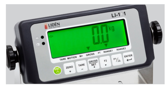
LCD display with LED backlight