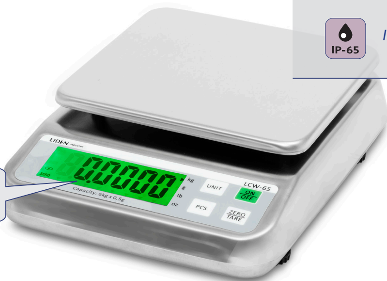
Table scale with high resolution in stainless steel design for weighing in dry and humid environment. LCD display, rechargeable battery and counting function as standard.