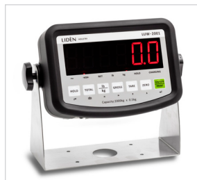
30 mm LED-display