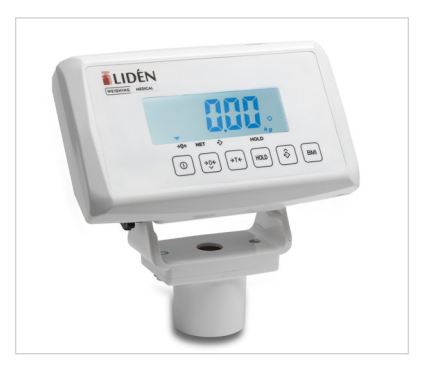
Display with distinct numbers, which makes it easy to read