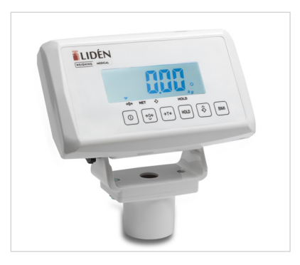
Display with distinct numbers, which makes it easy to read